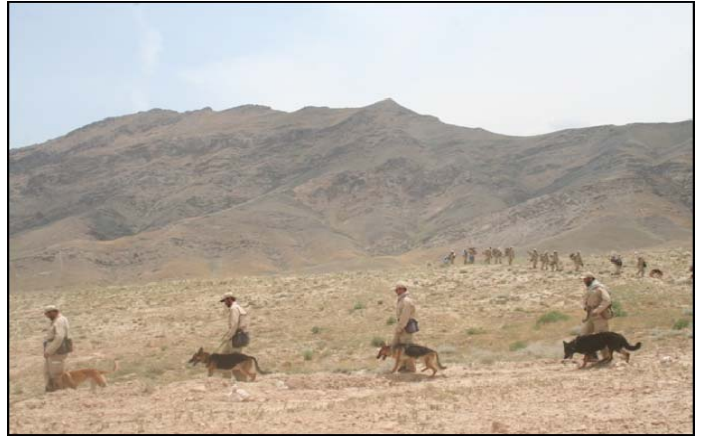
MDD teams returning from demining operation in Charasyab district / June 2009

The Mine Action Coordination Centre of Afghanistan (MACCA) supported by the United Nations and the Government of Afghanistan through its Afghanistan National Disaster Management Authority (ANDMA)/Department of Mine Clearance (DMC) have formed a partnership within the MACCA offices to plan, coordinate and ensure the quality of all mine action activities in Afghanistan.