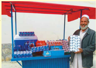
Income Generation Assistance in Kunduz