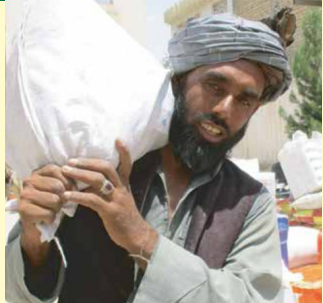
Immediate Assistance in Badghis