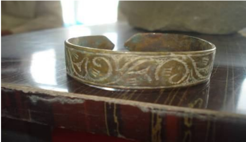
Above: This bracelet was discovered by a deminer working in Shar-e-Ghulgula