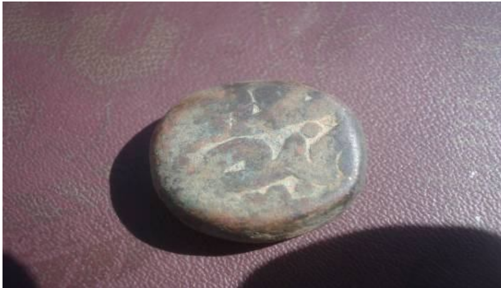
Above: One of the coins found at Zuhak