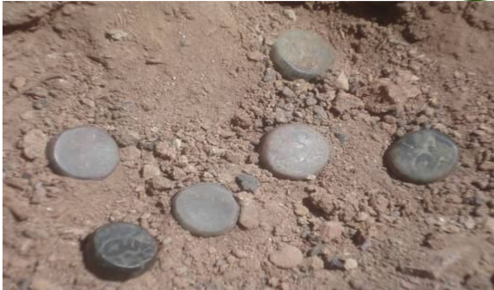
Above: These ancient coins were detected by a deminer working in Zuhak.