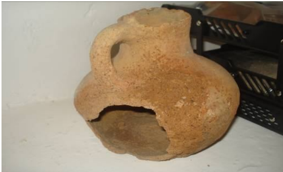
Above: This large piece of ancient pottery above was also found by a deminer working in Shar-e-Ghulgula